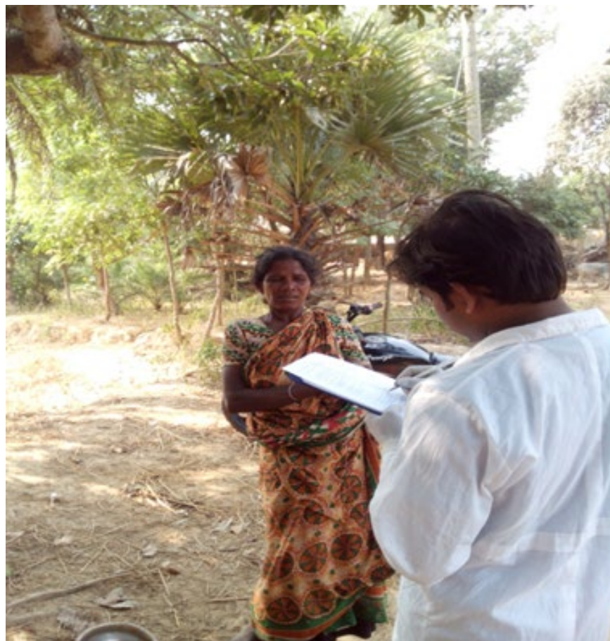
Figure 1: During surveillance at field

The collected survey data were severer in excel sheet and statistical analysis have been performed by using STATA (College Station, Texas 77845 USA) to find out if there was any significant