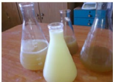
Figure3.1.: Wheat bran extract.