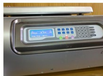
Figure3.2.: Centrifuge with 50 ml tube capacity.

All the selected media had a constant pH and so temperature as it determined in the first place, which is 7.2 pH and 30°C. The pH was controlled with the same procedure (NaOH, HCl, pH meter), and the temperature was set on the shaker incubator.