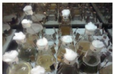
Figure3.5.:Media after cultivation

All media combination for the proper media selection were steril-