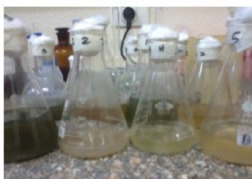
Figure3.3.combinations of media.

A Collected mixtures of the previous liquid were tested as a whole combinations of all trials, as shown in Table3.1..