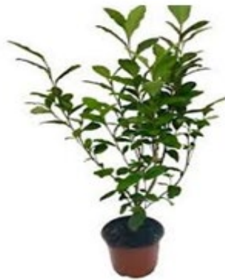
Figure 1: Drawing of the Camellia sinensis [19]

Green tea is one of the largest drink using in the worldwide, Asia is the largest population of use this beverage whatever Europe increased significantly over 30 years ago. [19]